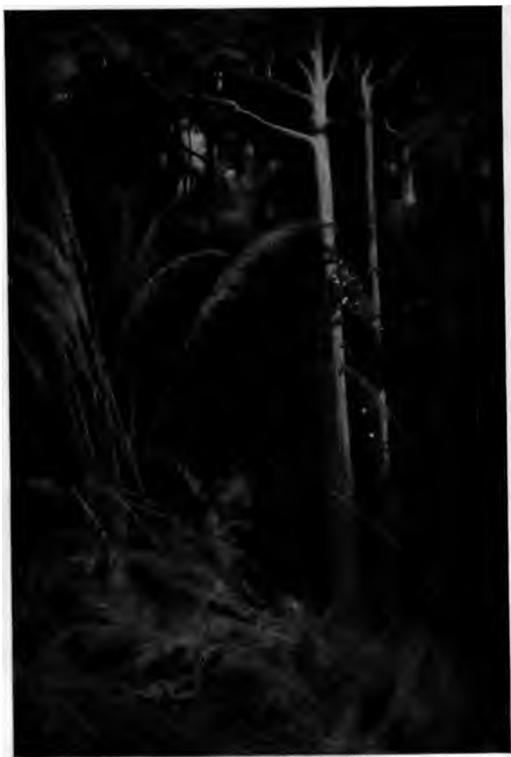
IN THE DEPTHS OF THE FOREST.